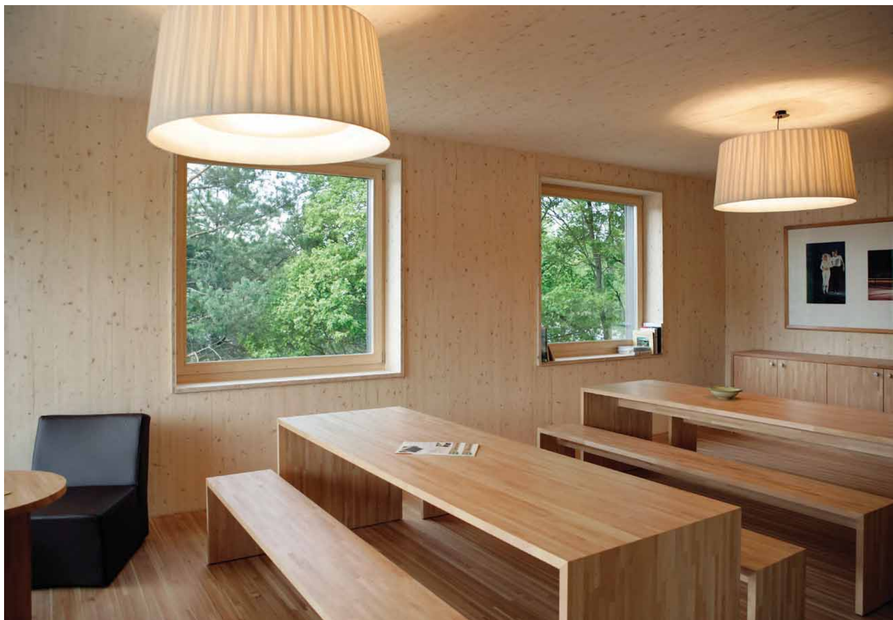
50 Exposed wood interior space

able to work more efficiently in order to consume less of everything. Architects and engineers will need to study natural and biological processes and try to introduce these into their architectural design. Humankind will not be able to survive if the principles of nature are further neglected. Can there be any greater public interest than this?