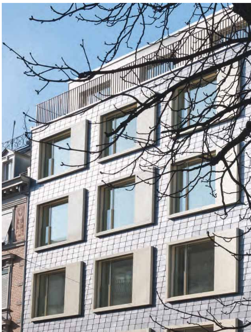
South façade produces energy by solar collectors

Annual energy consumption balance: 20kWh/a