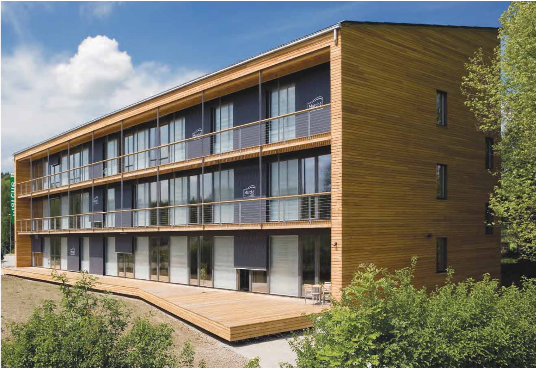
Marché Headquarters, Kempthal, Switzerland, 2007, office building, prefabricated timber structure, energy and ecology label: Minergie-P-Eco, net zero energy building: 20 kWh/a