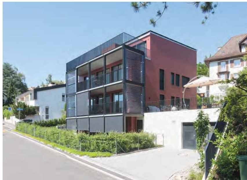
Kürberg House, Zürich, Switzerland, 2011, prefabricated timber structure (not externally exposed), energy and ecology label: Minergie-P-Eco, PV on the roof, energy consumption balance: 0 kWh/a

The 20th century was the time of the architecture of light, air, and space. It was also a period of growth and increasing wealth. "Less is more," originally defined as an aesthetic paradigm of formal reduction, simplicity of details, and repetition of elements, had a huge influence on the higher speed and lower cost of construction. These factors had an enormous influence on the architectural design and can be seen in any business district around the world.