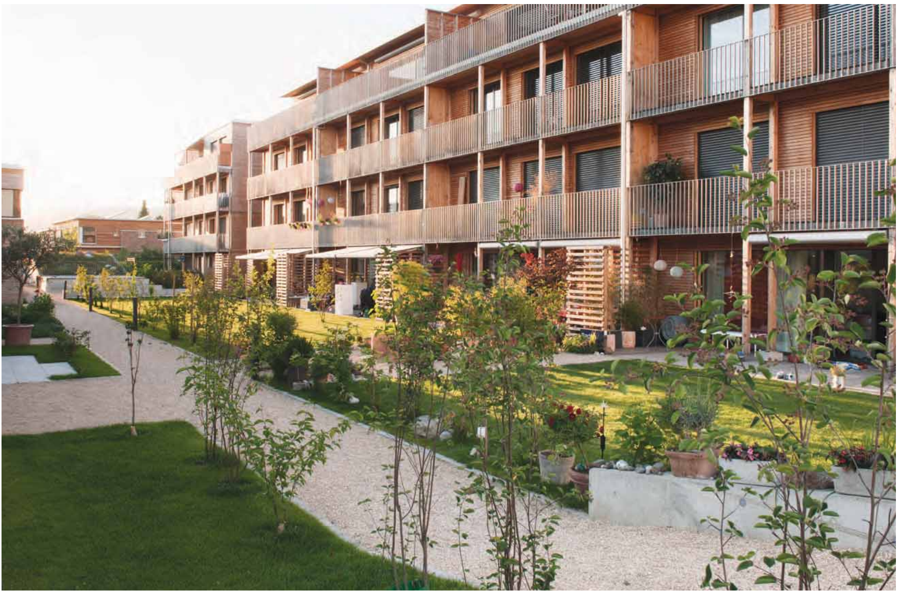
48 SunnyWatt Condominiums, Watt, Switzerland, 2010, timber-clad, prefabricated timber structure, energy and ecology label: Minergie-P-Eco, annual energy consumption balance: 0 kWh/a

mate. The discovery of fossil fuels made heating and cooling easy and cheap. They allowed the problems of poorly constructed architecture not designed to the local climate to be corrected by technical systems. The movement away from using fossil fuels means that energy efficiency and working with the climate have again become priorities.