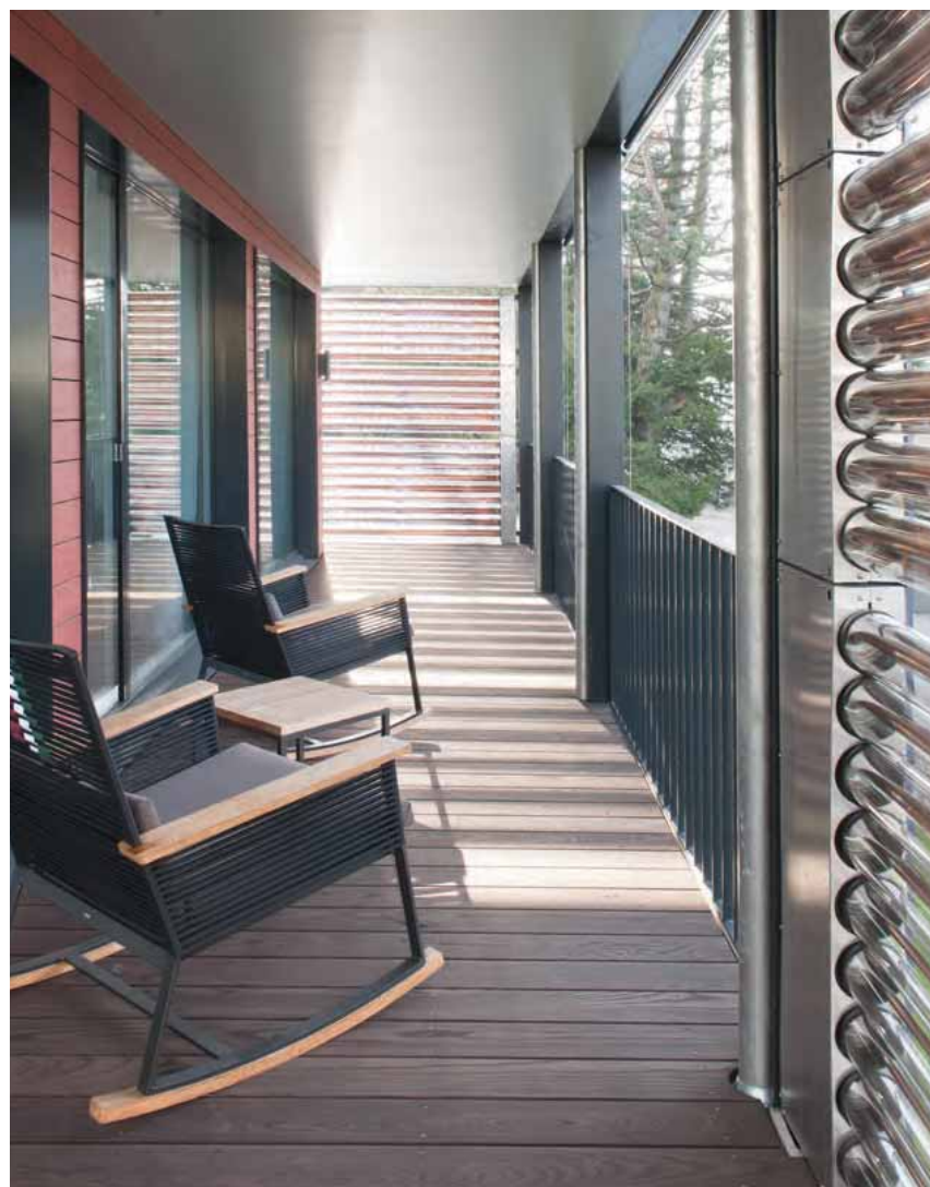
Comfortable loggia shaped by high tech elements in Kürberg House