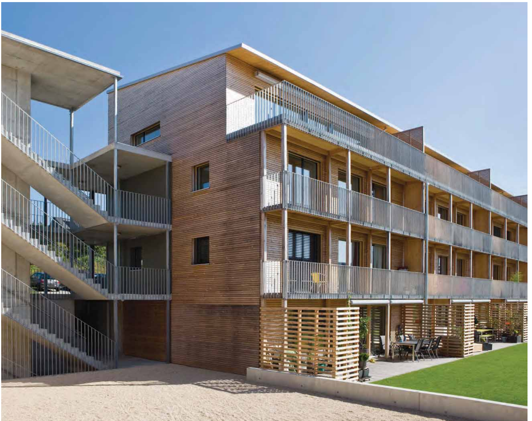
SunnyWatt Condominiums, Watt, Zürich