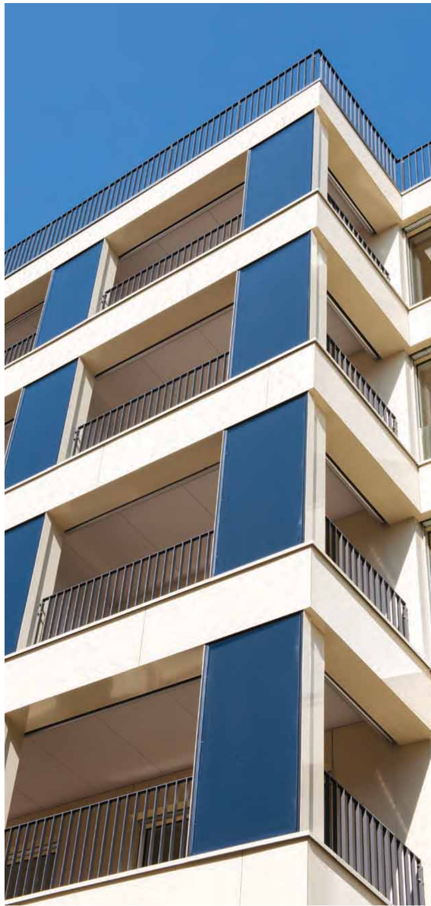
North façade integrates in the urban fabric